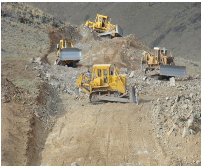
PIPELINE 12" – TAROM_ ZANJAN