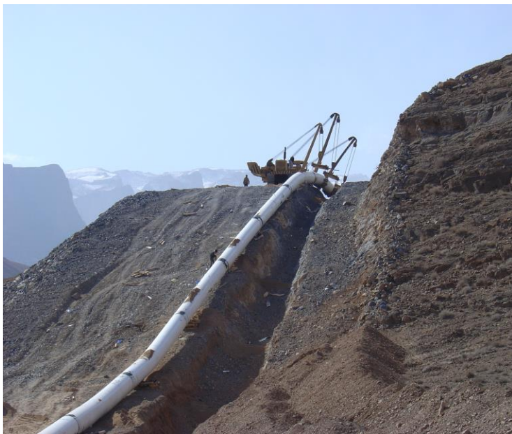
PIPELINE 40" – SOUTH ESFEHAN