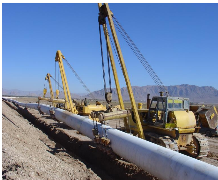
PIPELINE 40" – SOUTH ESFEHAN