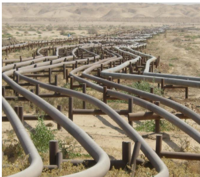
PIPELINE 16" – PAYDAR GHARB