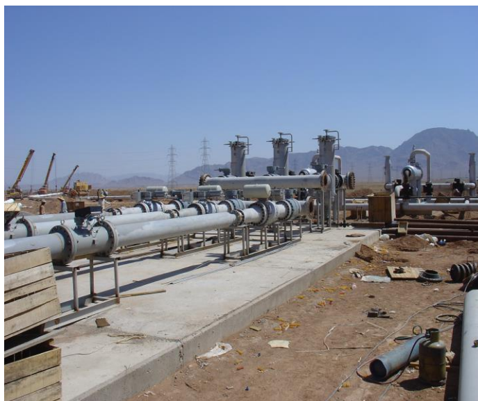
PIPELINE 20" – MAJLESI POWER