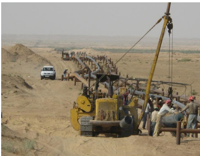
PIPELINE 16" – PAYDAR GHARB