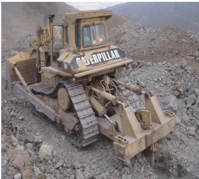
PIPELINE 12" – TAROM_ ZANJAN