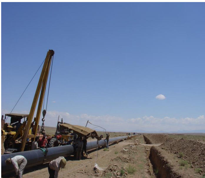
PIPELINE 30" – SOUTH KHORASAN