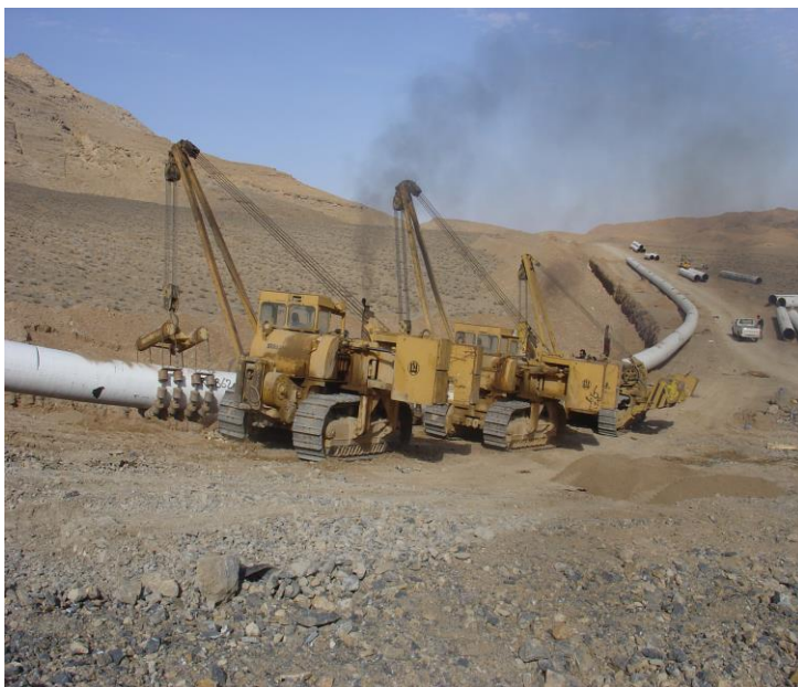
PIPELINE 40" – YAZD