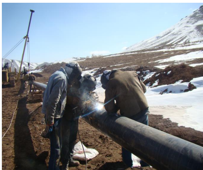
PIPELINE 12" – TAROM_ ZANJAN