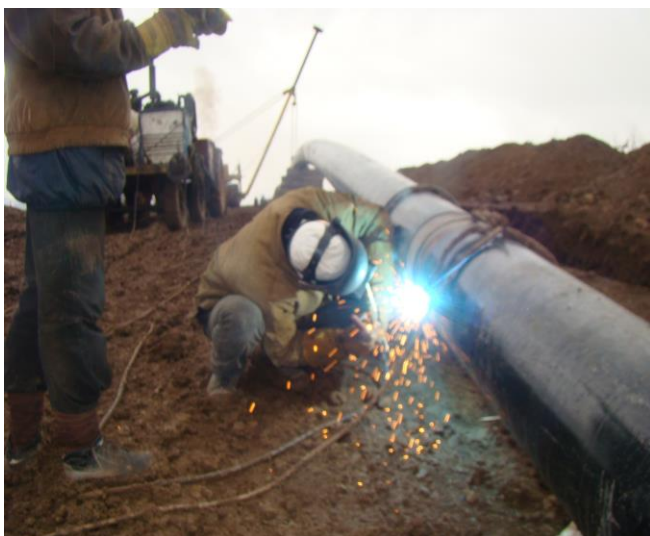
PIPELINE 12" – TAROM_ ZANJAN