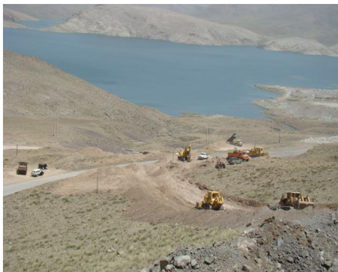
PIPELINE 12" – TAROM_ ZANJAN