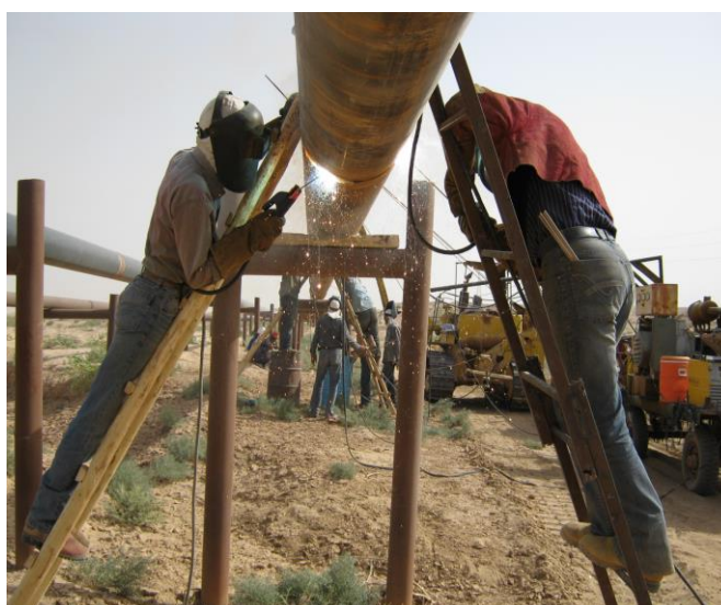
PIPELINE 16" – PAYDAR GHARB