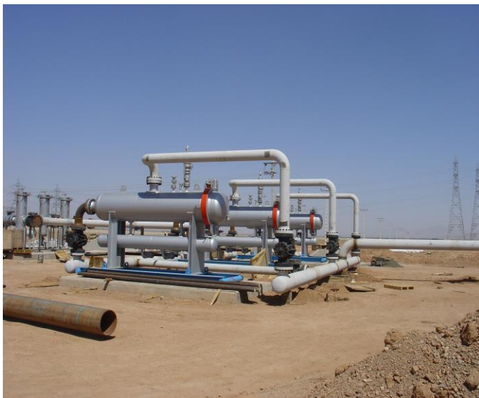
PIPELINE 20" – MAJLESI POWER